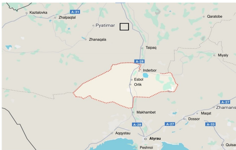
Figure 1. Area of geological exploration for boron-potassium salts.